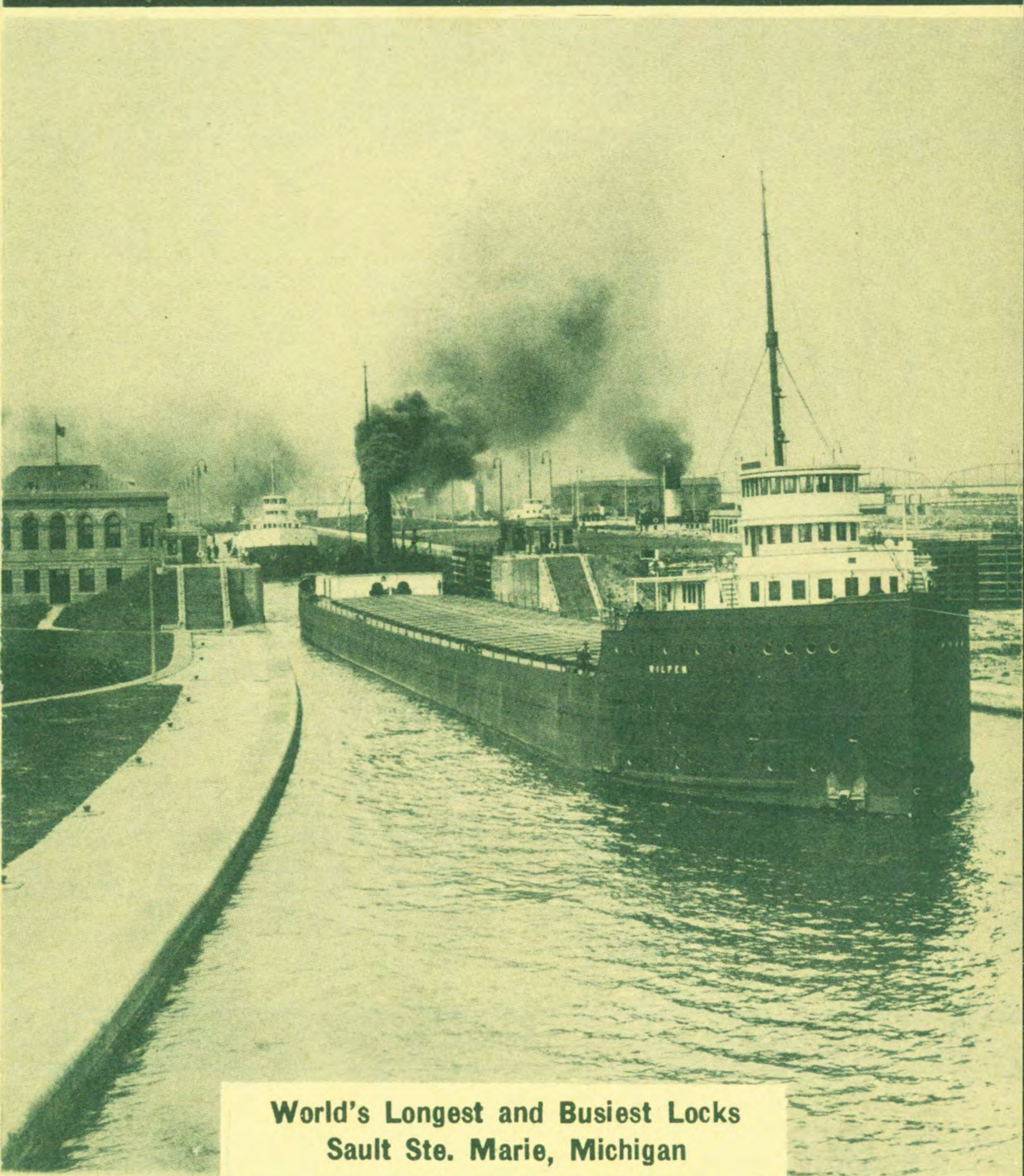
World's Longest and Busiest Locks Sault Ste. Marie, Michigan

SAULT STE. MARIE WASHINGTON CLEVELAND CHICAGO DETROIT AKRON NORFOLK PITTSBURGH WILLIAMSPORT